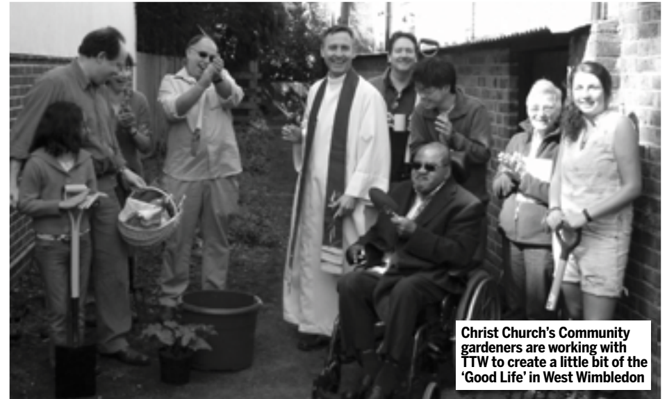
Christ Church's Community gardeners are working with TTW to create a little bit of the 'Good Life' in West Wimbledon