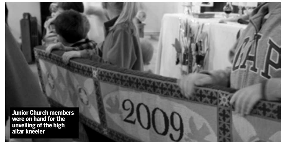
Junior Church members were on hand for the unveiling of the high altar kneeler