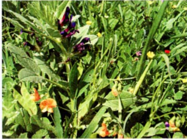
Spring flowers around Salt (left) and flowers in Gilead (above)