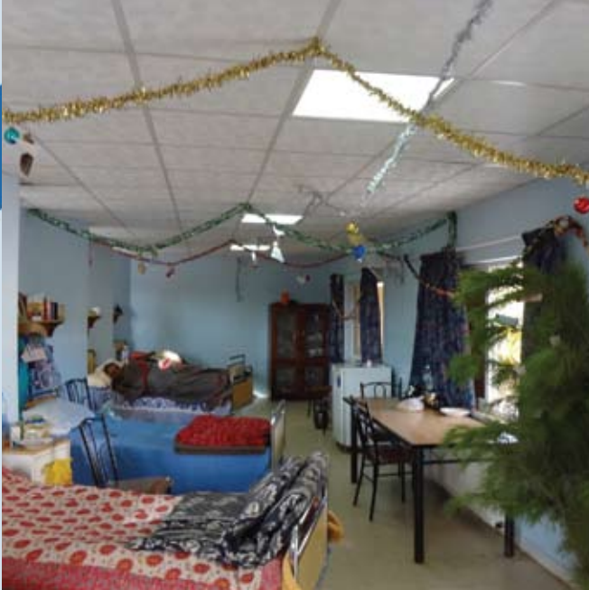
A ward decorated for Christmas by the patients

Shortly after arriving I attended a biannual spiritual refreshment weekend organised by An-Noor. It was a superb chance to get to know them, and for spiritual motivation. The theme " Love & Unity " was good for bonding us together in the Lord; this is especially vital now as several are serving here who departed their country of service. At the end of November I moved to Mafraq.