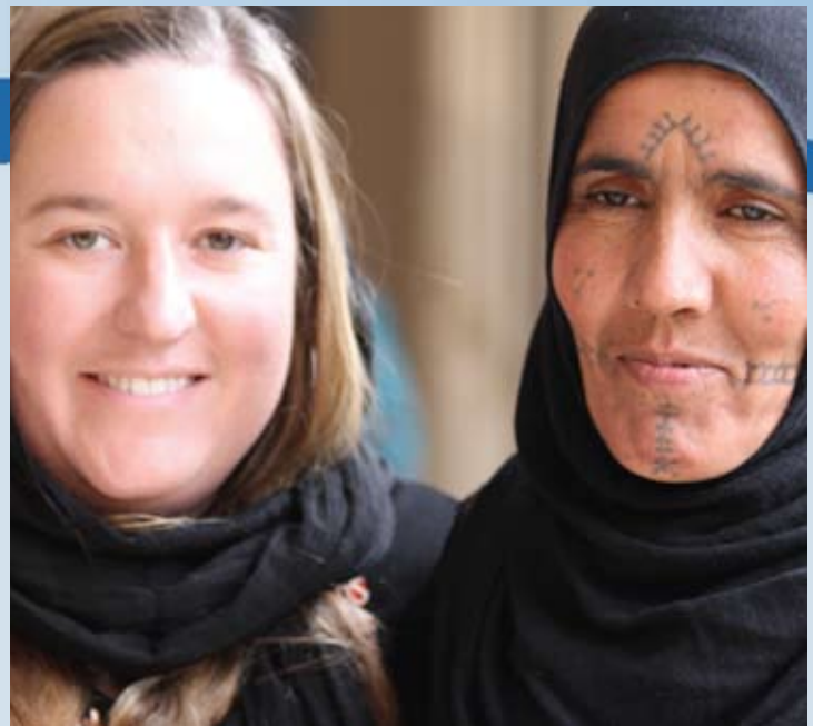
A Bedu lady who visited from the south

Induction to An-Noor is challenging, exciting and fun all at the same time. New skills have to be learned or developed such as giving injections, learning about TB and chest disease symptoms, medications and chest physio, nebulisers and