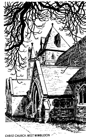
CHRIST CHURCH, WEST WIMBLEDON